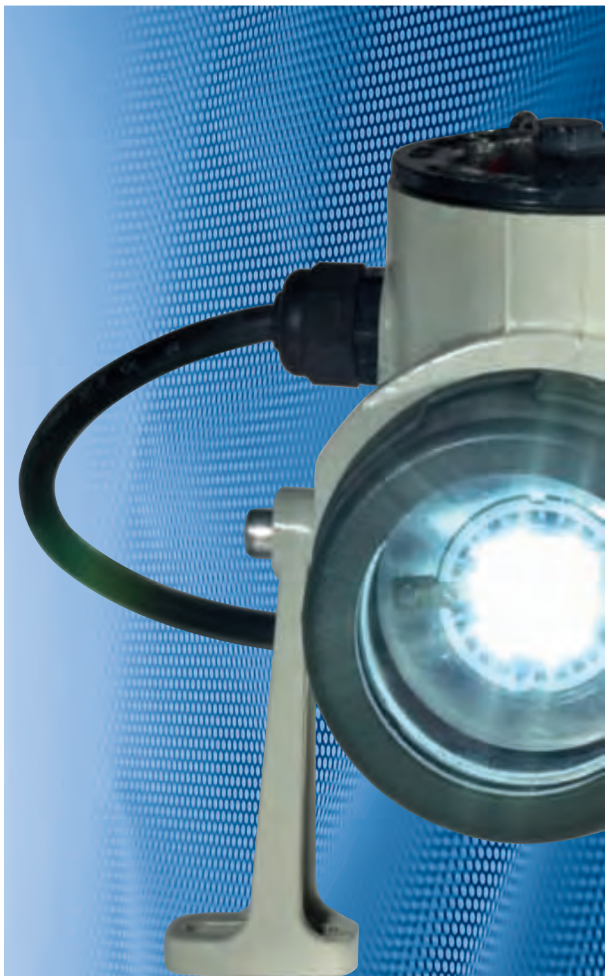
Polar curve KFL 7 LED

With the light fitting holder PR it can be mounted on inspection windows according to DIN 28120.