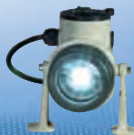
KFL 7 LED