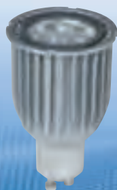
Philips 7 W LED lamp